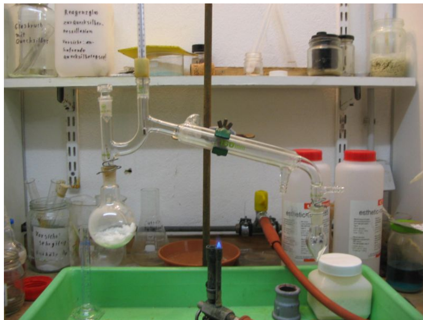
Figure 1: apparatus prepared for distillation