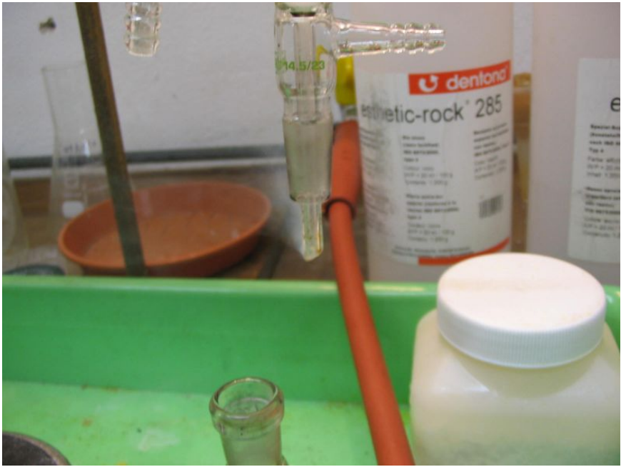
Figure 3: sulfur trioxide fuming in air