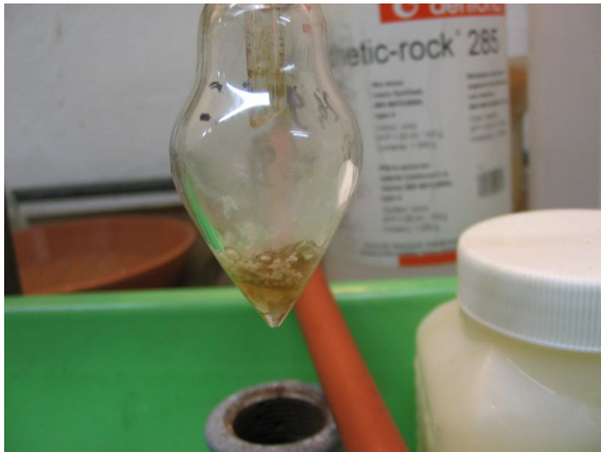
Figure 2: sulfur trioxide in receiver

This can be very dangerous. The solid \text{SO}_3 can be melted by means of a hot air gun if it is found to crystallize at the condenser outlet.